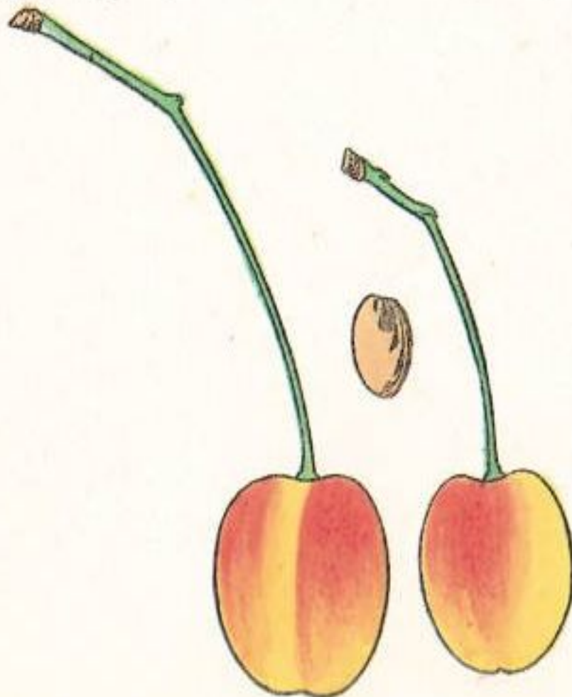
3. Königin Hortensia. (Nr. 58.)